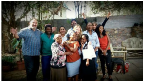
Regular staff events and workshops are a must!