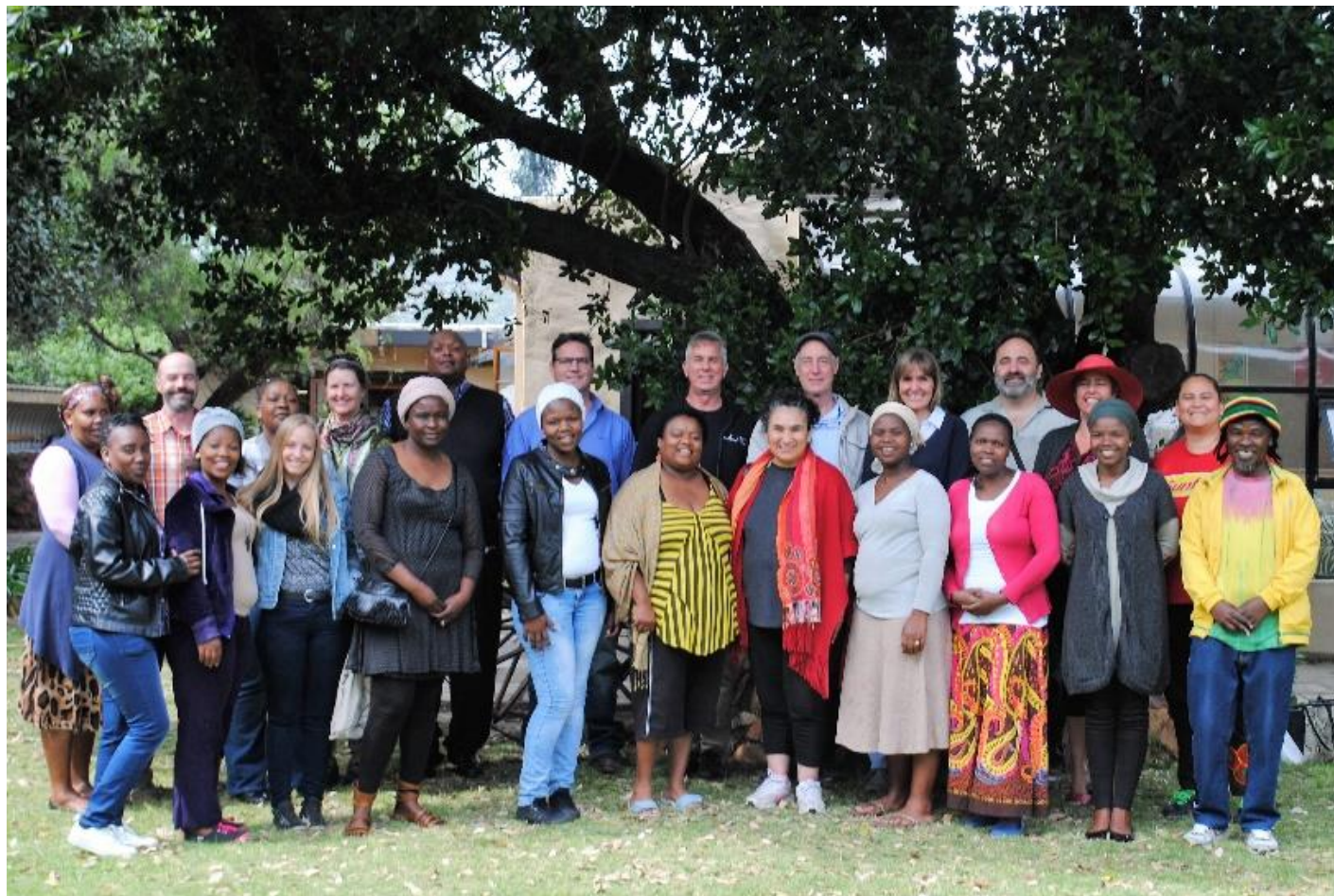
Work For Love 2016

Our Bank Accounts and registration numbers will stay the same. Our new name is Bhongolethu Foundation.