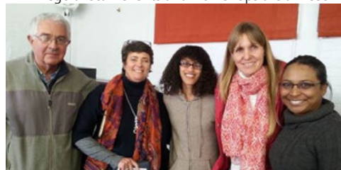
Collaboration and networking conferences and meetings to inspire our work.