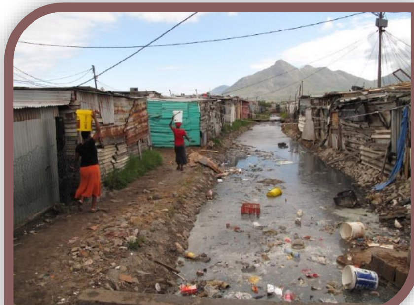
Masiphumelele wetlands with view of Chapman's Peak. This is where the Siyakhula play school was originally founded by a group of mothers wishing to serve and protect the vulnerable children in October 2008.