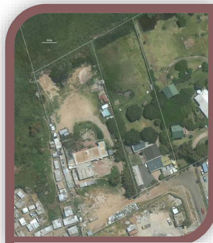
Arial view of Chameleon Gardens with plot 1 on the right and plot 2 on the left.

Fortunately, the Chameleon Garden property land use application for a place of instruction for Early Childhood Development, Primary School and Adult Training Centre has been approved in February 2015 after a lengthy process. Various building upgrades will be