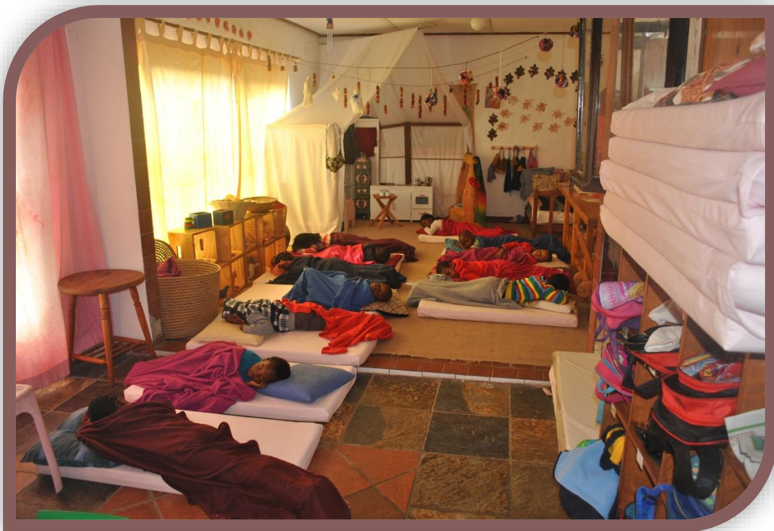
Classroom at sleep time after dilapidated main house at plot 2 has been renovated

Our thanks to all those who have helped make this possible with a special thanks to Electrospec who have provided the extensive electrical and plumbing work free of charge.