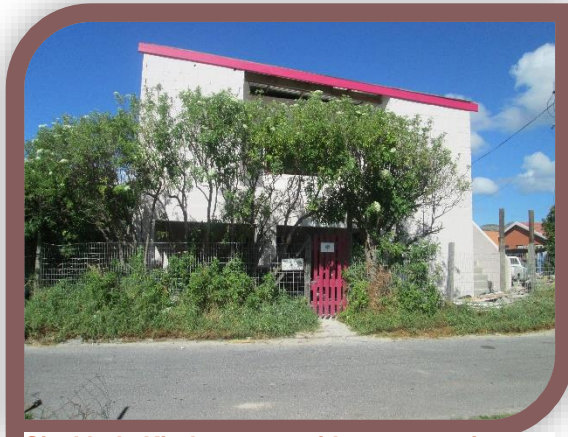
Siyakhula Kindergarten with new upstairs classroom thanks to the Lycee Caousou and the Build-A-Class-Build-A-Future Campaign.

Work for Love had a year of dramatic building construction in 2014. This came after lengthy planning and fundraising efforts and we are delighted with the support we received and the improvements to our facilities.